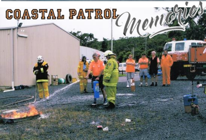
RVCP Members involved in Hands On Fire Fighting Training